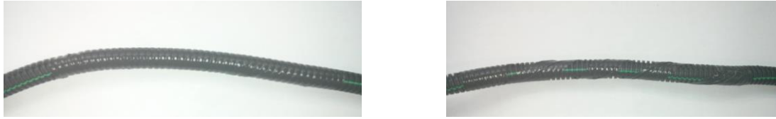
Figure 1 Splice over the GAF tube

Thus, in this case 2 types of can be used splice: splice dense - with cover - Figure 1.a, splice rare - without cover - Figure 1.b.